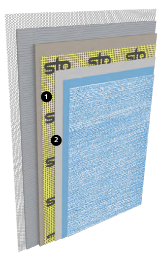
1 Sto Mesh

Traditional plaster is a beautiful finish and stucco systems are one of the most popular systems in the United States. What is not popular is the potential for cracking to appear. Sto offers an easy solution to minimize the occurrence of cracks in the surface of the wall system. Sto Crack Defense adds strength and flexibility to the outer wall surface. It consists of a layer of Sto woven glass fiber reinforcing mesh embedded in Sto polymer basecoat. It is an ideal option when specifying a smooth finish or to repair existing stucco walls.